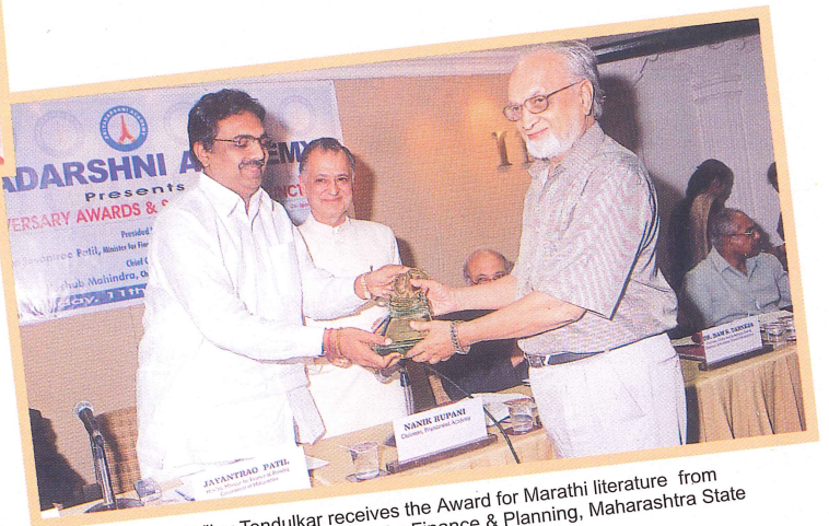
Shri Vijay Tendulkar receives the Award for Marathi literature from Shri Jayantrao Patil, Minister for Finance & Planning, Maharashtra State