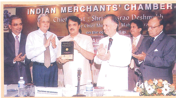
Shri Vilasrao Deshmukh, Hon'ble Chief Minister of Maharashtra releasing the book Kautilya's Arthashastra Its Contemporary Relevance at Indian Merchants' Chamber on April 21, 2005.

This handy volume is an indispensable reference book for all including corporates, businessmen, administrators, bureaucrats and opinion leaders. The book is available with India Book Distributors or in all leading book stores and is priced at Rs. 300 (courier charge extra) in India and US$15 (inclusive of airmail charge) abroad.