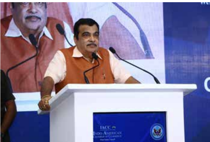
Mr. Nitin Gadkari addressing the audience.