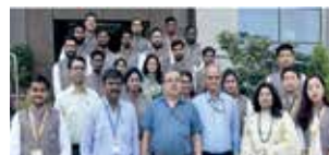
Various Human Rights Commission