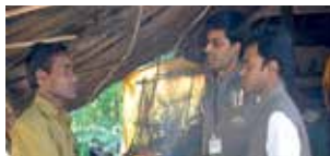
Most Under Developed Rural Area Visits