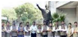
Various State Assemblies