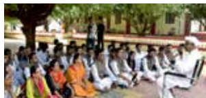
Various Gram Panchayats