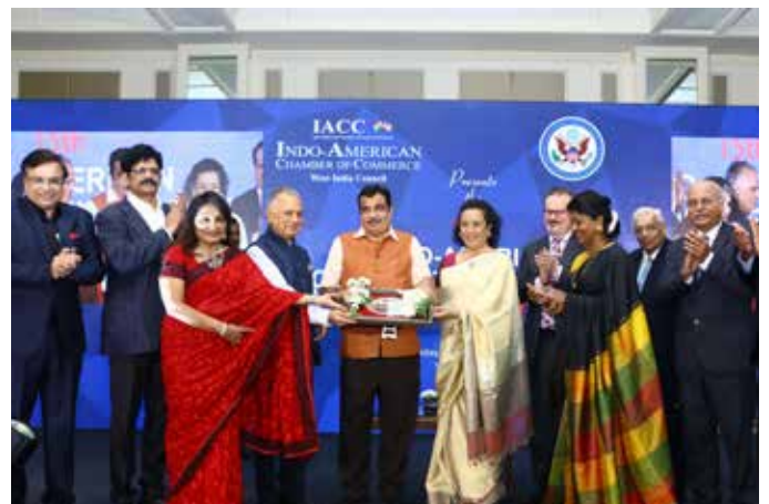
Memento Presentation to Mr. Nitin Gadkari.