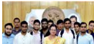
Local Self Govt. Offices