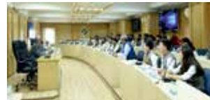
Various Election Commissions