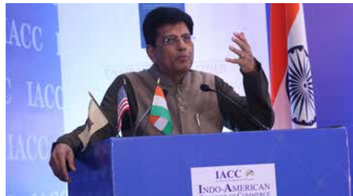
Chief Guest Mr. Piyush Goyal, Minister for Railways and Commerce & Industry, addressing the audience.