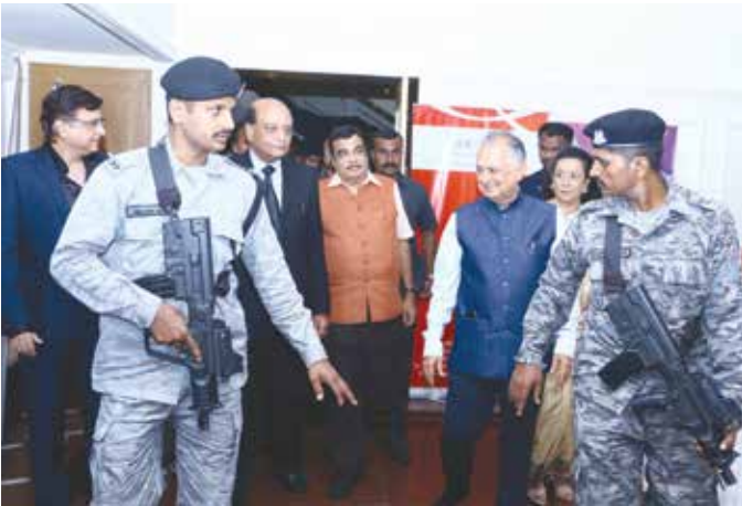
Chief Guest Mr. Nitin Gadkari, Minister for Road Transport & Highways, and Micro, Small & Medium Enterprises, arriving at the function.