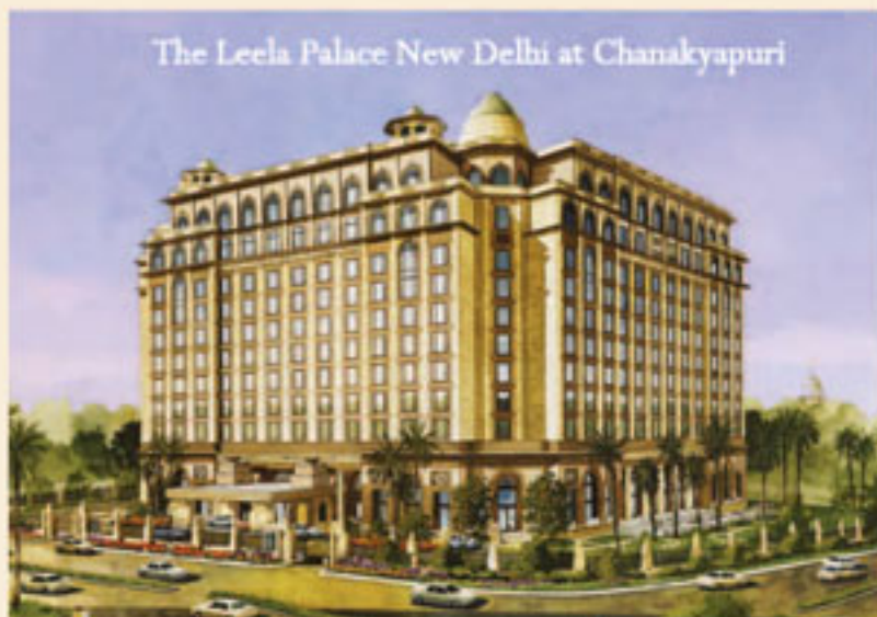
The Leela Palace New Delhi at Chanakyapuri