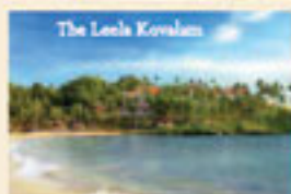
The Leela Kovalam