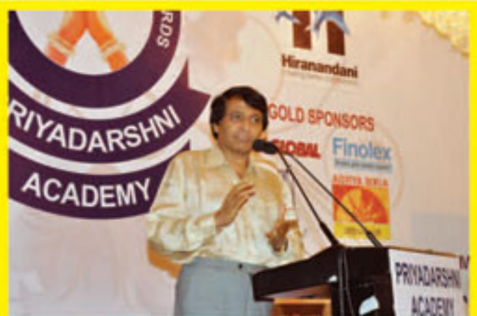
Mr. Suresh Prabhu, Chairman of Council for Energy, Environment and Water (CEEW), addressing the audience