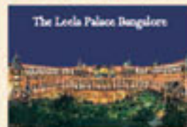
The Leela Palace Bangalore