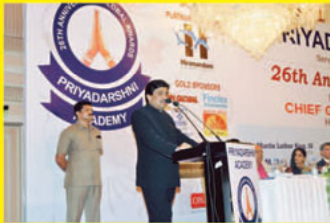
Chief Guest, Mr. Ashok Chavan addressing the audience