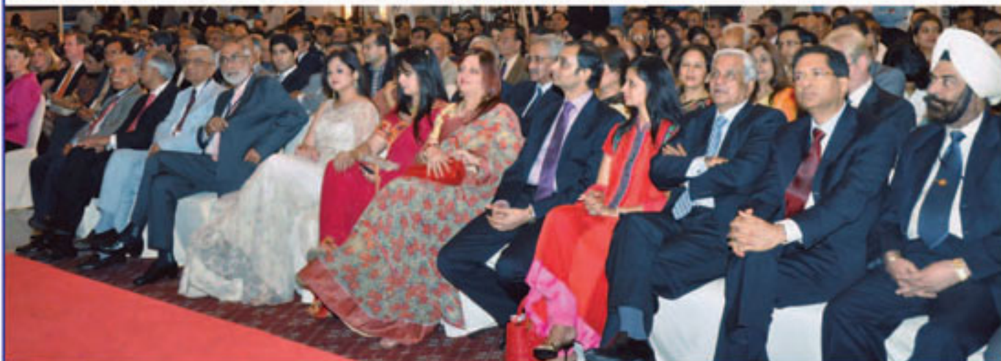
A section of the audience at the 26th Anniversary Global Awards Function