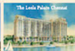
The Leela Palace Chennai

The Leela Palaces, Hotels and Resorts is one of the finest hotel groups in India providing discerning business and leisure travelers with relaxed and memorable experiences that embrace the essence of India. Visit our hotels in New Delhi, Bangalore, Mumbai and Gurgaon to discover that business can be a pleasure too. Then when you need a holiday, make your way to our luxurious beach resorts in Goa and Kovalam and to our palace hotel in Udaipur - a jewel by the lake Pichola.