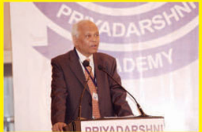
Dr. R. A. Mashelkar addressing the audience