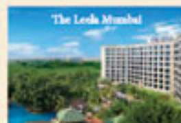
The Leela Mumbai