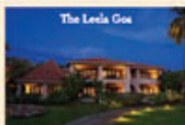
The Leela Goa