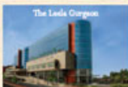
The Leela Gurgaon