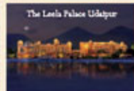
The Leela Palace Udaipur