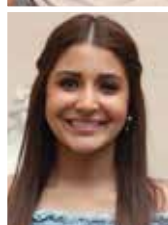
Ms. Anushka Sharma Actor Mumbai, India

Priyadarshni Academy Global Award for outstanding contribution to Innovative Entertainment and Community Development