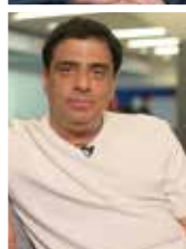
Mr. Ronnie Screwvala Founder Director Swades Foundation Mumbai, India

Harish Mahindra Memorial Global Award for outstanding contribution to the promotion of Peace and Crisis Management