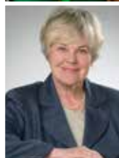
Ms. Elisabeth Rehn Hon. Minister of State Finland