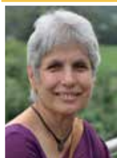
Ms. Anu Aga Non Executive Director Thermax Ltd. Pune, India

Priyadarshni Academy Global Award for outstanding contribution to Education for Underprivileged