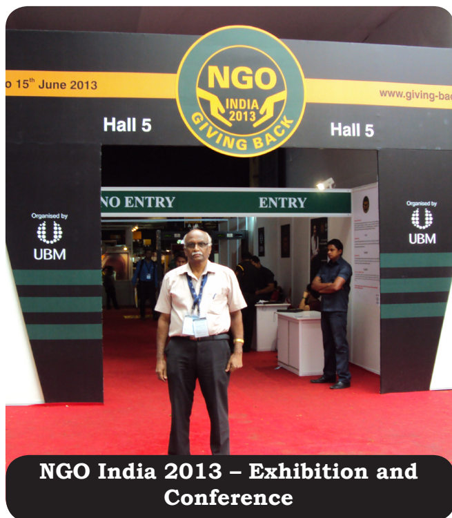
NGO India 2013 – Exhibition and Conference

to mankind is the best work of life”. Since we have taken so much from society, it is our duty to give back.