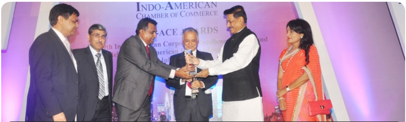
Chief Guest Prithviraj Chavan presenting a trophy to an awardee

Indo-American Chamber of Commerce, West India Council, celebrated its 9th unique Indo-American