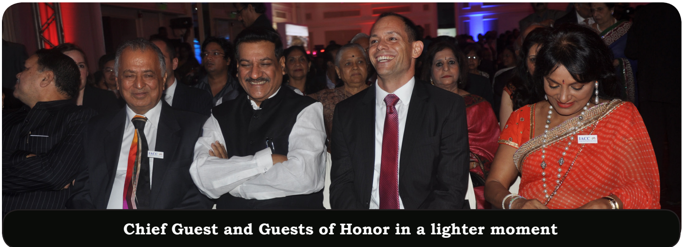
Chief Guest and Guests of Honor in a lighter moment