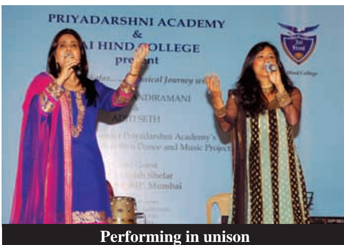
Performing in unison