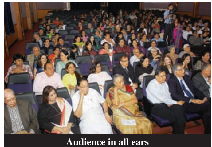
Audience in all ears