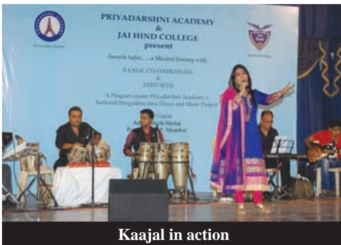
Kaajal in action