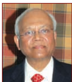
Dr. R. A. Mashelkar

Dr. Mashelkar did India proud and did Priyadarshni Academy proud on Indian Republic Day. In the newspapers on the 26 th of January, his name figured prominently in the list of Padma Vibushan awardees. It was a great coincidence that the Priyadarshni Academy leadership was in New Delhi the very same day to present its Global Award to the Japanese Prime Minister. It was Dr. Mashelkar indeed, who, as Head of the Academy's Global Awards Committee, had strongly endorsed the nomination of Mr. Shinzo Abe in 2011 to receive the award. Mr. Abe became Prime Minister subsequently. The entire Priyadarshni family, as indeed the whole of India, extends its heartiest congratulations to the eminent scientist.