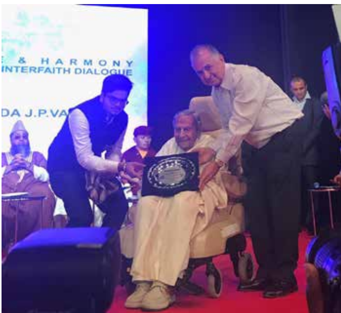
Mr. Rupani felicitating Dada J. P. Vaswani at the 'World Peace & Harmony through Interfaith Dialogue' Conference on April 28, 2017 at Birla Matushri Sabhagar