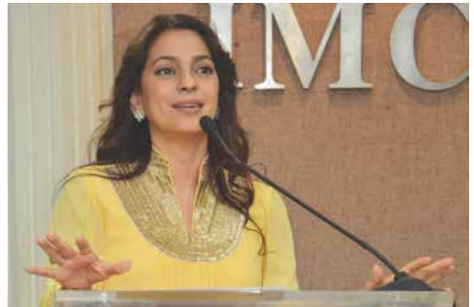
Ms. Juhi Chawla Mehta, Guest of Honour, addressing the audience