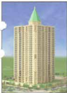
Hiranandani – Cardinal Building with 29 Floors, Two Basement, Parking at Hiranandani Estate, Thane