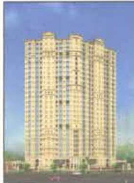
Hiranandani – Lavinia A & B – 25 Floors & Basement at Hiranandani Estate, Thane.