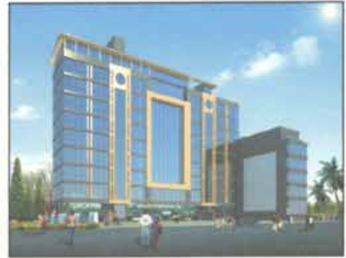
M/s. Bhaveshwar Properties Pvt. Ltd. – Basement -1 + Stilt + 9 Upper Floors at Ghatkopar (W), Mumbai.