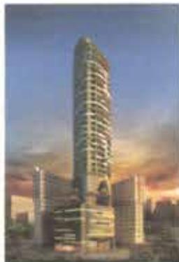
Lokhandwala Infrastructure Pvt. Ltd. – Victoria Tower - 45 Towers (175mtr Height)