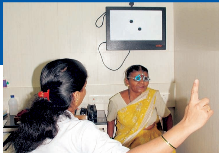
A patient being examined at the vision foundation during the eye check up camp.

Priyadarshni Academy, in collaboration with Vision Foundation of India, organized a highly successful Eye Camp on March 12. One hundred and twenty eight patients were examined in the camp by eye specialists and 30 patients were identified for surgery. These patients will be operated over a period of a month. The operations are sponsored by Priyadarshni Academy.