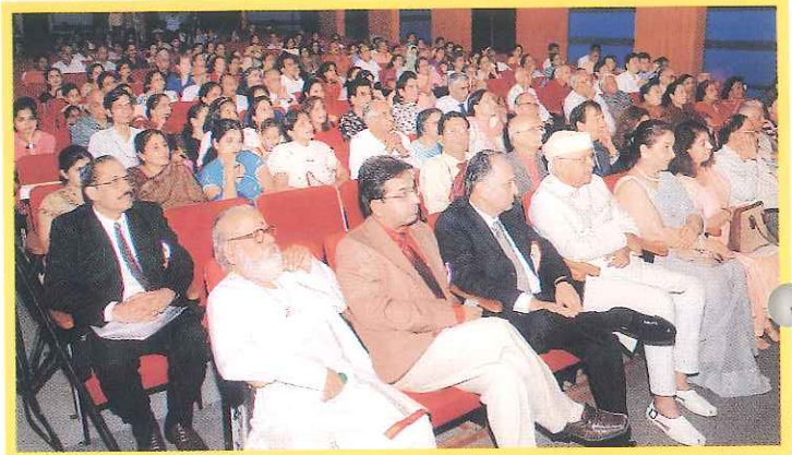
A view of the audience at the National Integration through Dance Programme at the K. C. College Auditorium.