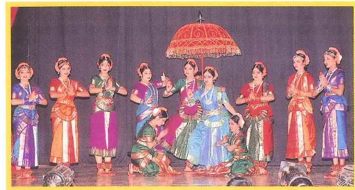
Artistes of Kalasadan performing the Ramayana ballet.