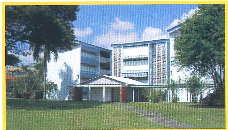
A view of the I 2 IT Singapore campus.

The training in the institute is application-oriented. The institute is situated amongst leading IT companies such as Infosys, Wipro, Tata Technologies, and Cognizant at the Rajiv Gandhi Infotech Park in Hinjewadi, Pune. It is an autonomous institute with the curriculum developed and delivered by leading academicians and industry professionals. Visiting