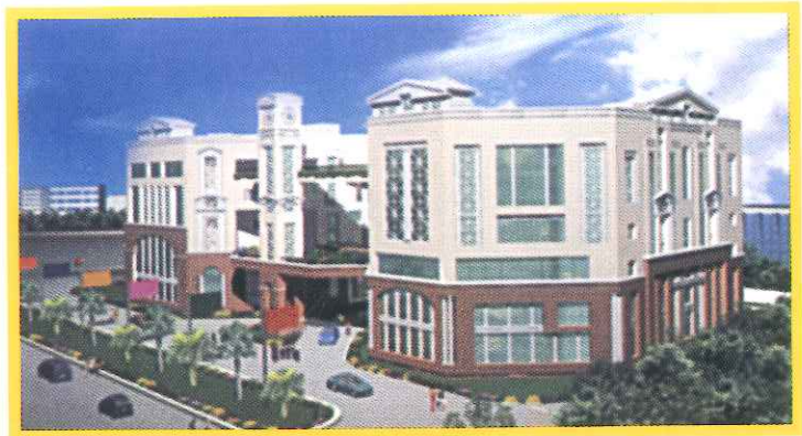
A close-up of the I 2 IT campus and the Advanced Technology Incubation Centre, Pune.

Without doubt, the city of Pune, which has always boasted of being a leading educational centre in India and is Maharashtra's knowledge capital, is fast becoming an advanced tech city teeming with leading IT and BPO companies and MNC engineering companies. Tech giants of India and the world are setting up operations and R & D bases in the city, in turn fuelling the demand for IT specialists and IT managers. Part of the reason for that development is the presence of this world-class institution in that city.